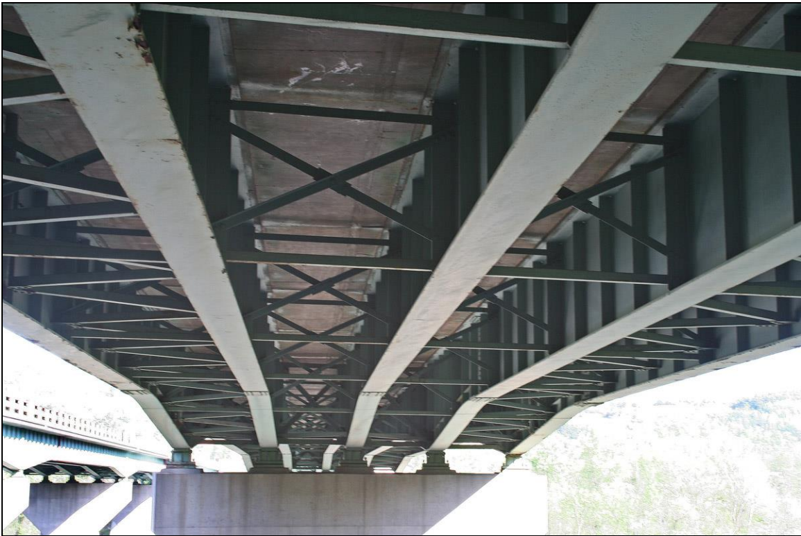
FIGURE 4: Southbound I-89, underside.