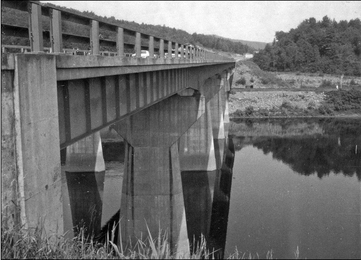
FIGURE 2: Southbound I-89 (NHDOT 1966).