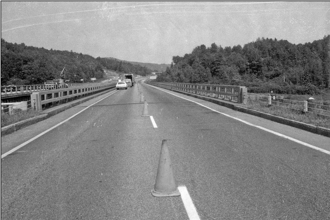
FIGURE 3: Southbound I-89 (NHDOT 1966).