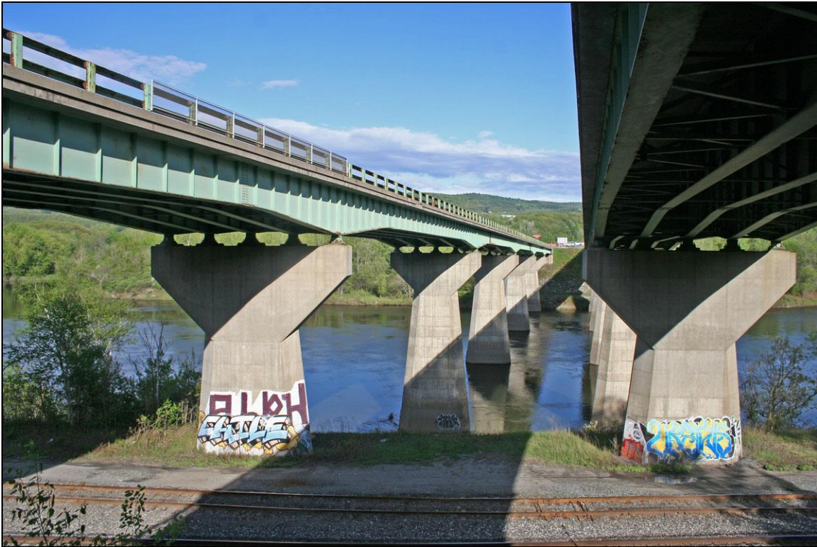
FIGURE 1: Northbound I-89 on left, southbound on right (Historic Documentation Company Inc. 2013).