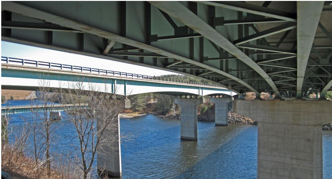
FIGURE 4: US I-93 Bridge, Littleton–Waterford, built 1976, 1981 (Historic Documentation Co. Inc. 2012).