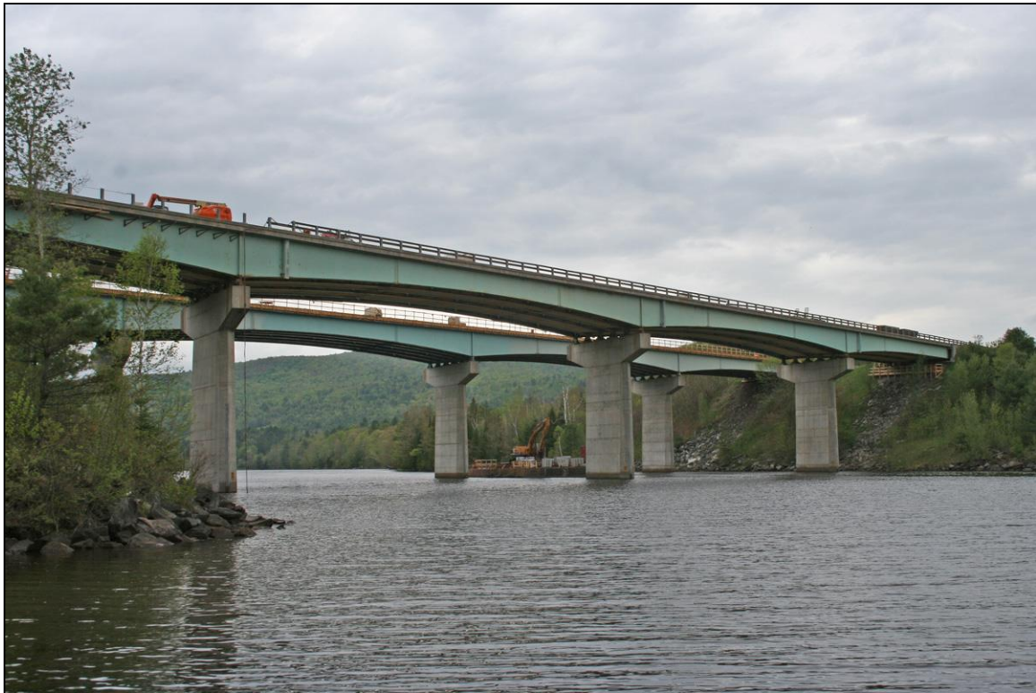
FIGURE 1: US I-93 Bridge, Littleton-Waterford, built 1976, 1981. Upstream side from New Hampshire (Historic Documentation Co. Inc. 2012).