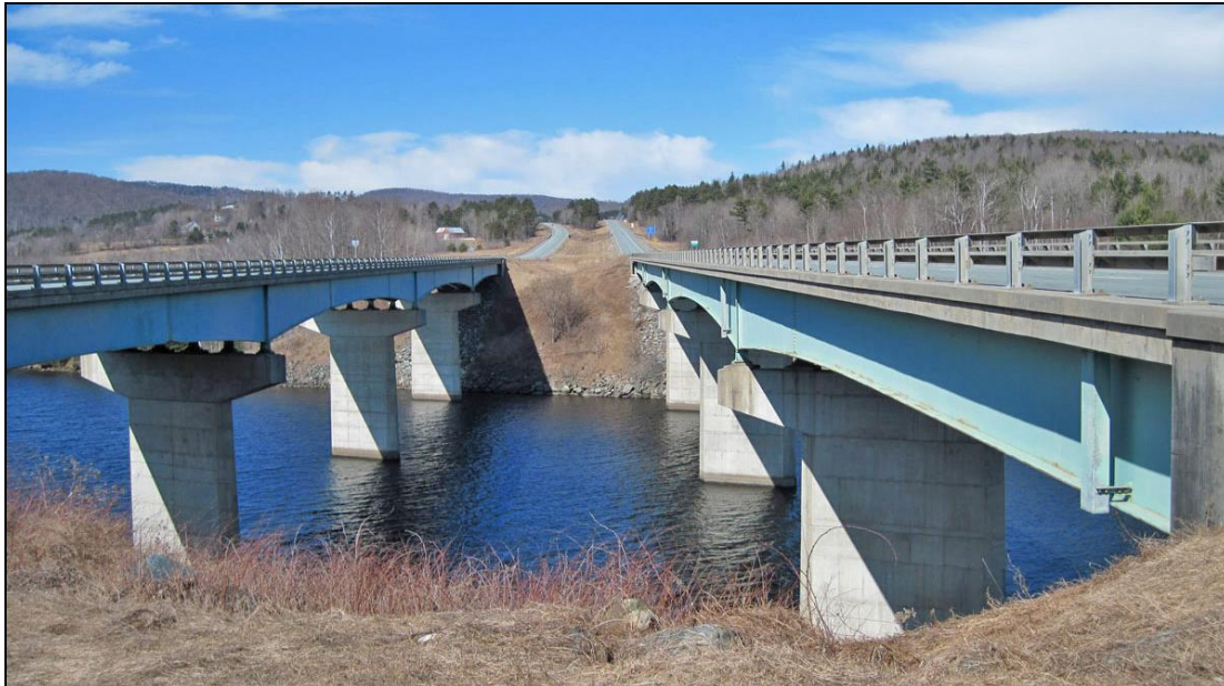
FIGURE 3: US I-93 Bridge, Littleton–Waterford, built 1976, 1981 (Historic Documentation Co. Inc. 2012).