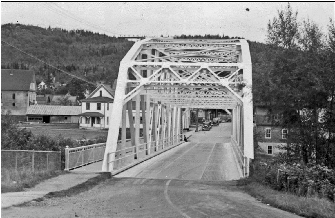
FIGURE 5: Stewartstown-Canaan Bridge, built 1928. Vermont approach, photo dated September 9, 1941 (NHDOT 1941).