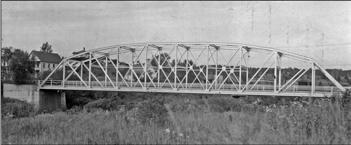
FIGURE 4: Stewartstown-Canaan Bridge, built 1928. Downstream side, shown in photo dated September 9, 1941 (NHDOT 1941).