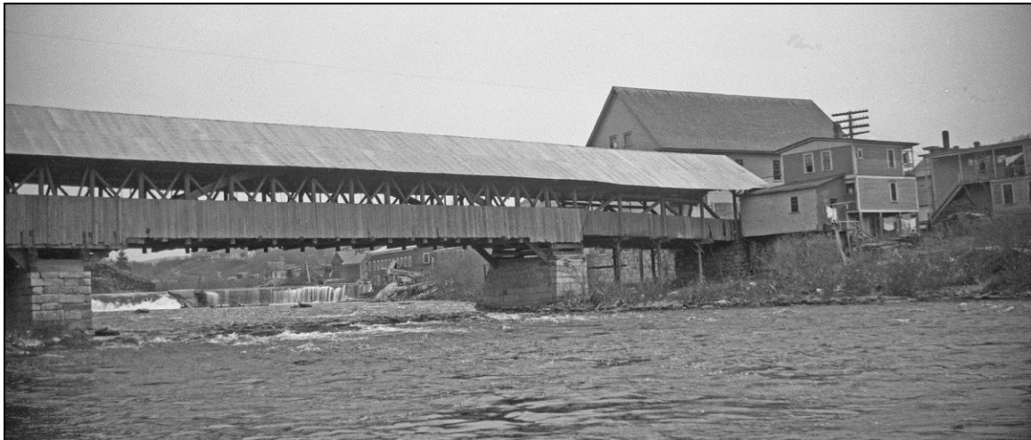
FIGURE 2: Stewartstown Bridge Company covered bridge, built c.1850. Photo dated October 30, 1922 showing downstream side from Vermont (Storrs).

Fourth bridge: During 1990-1991, NHDOT replaced the 1928 bridge with a 241-foot two-span steel plate girder structure carried on abutments of reinforced concrete.