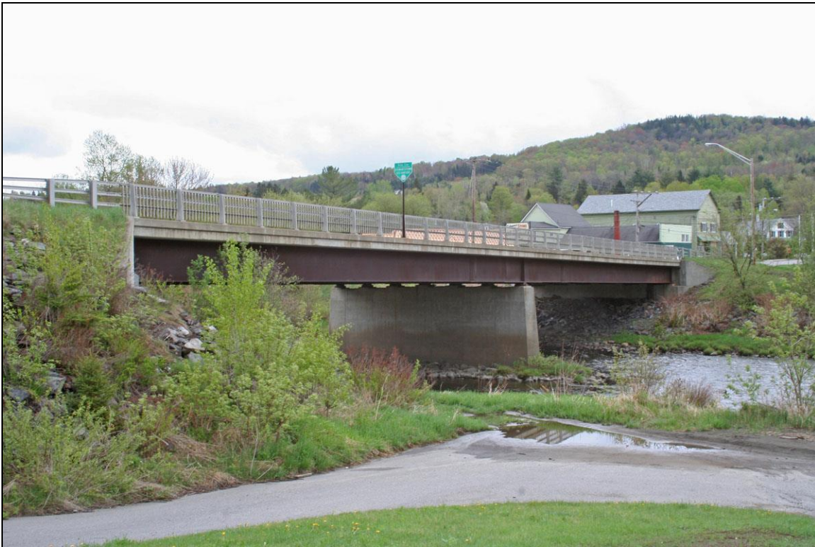
FIGURE 1: Main Street Bridge, built 1990. Downstream side from Vermont (Historic Documentation Company Inc. 2012).