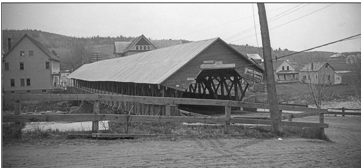
FIGURE 3: Stewartstown Bridge Company covered bridge, built c.1850. Photo dated October 30, 1922, showing upstream side and Vermont end (Storrs).